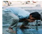
have my own bottle about